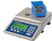
Counting & Inventory Systems