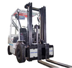
Forklift & Warehouse Scales