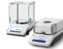
Laboratory Scales/Moisture Analyzers